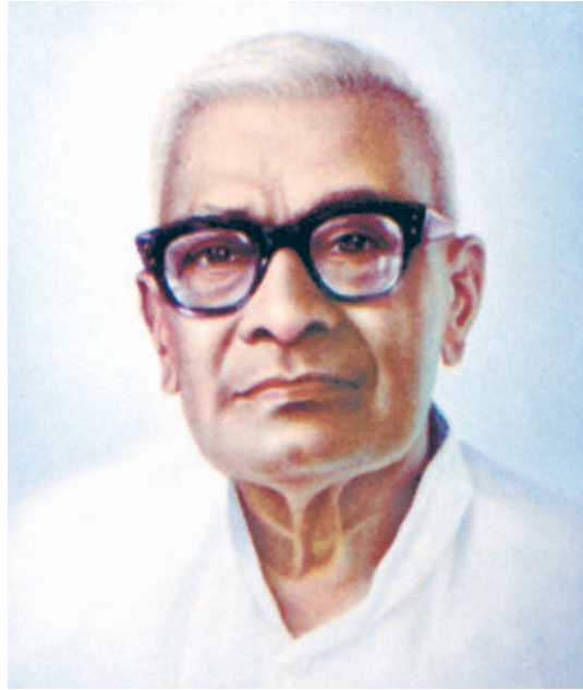
Founder Editor of Pudhari and Colleague of Mahatma Gandhi and Dr. Babasaheb Ambedkar.